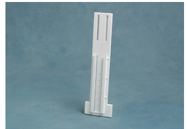
Variable height adapter

Attachment devices for use with ring brackets.