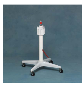
20 in. Roll stand with regulator mount