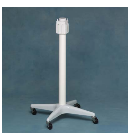
30 in. Roll stand

Roll stands allow flexibility in the location and configuration of Medi-Vac® Canister (CRD™, Flex Advantage® Liners or Guardian™ Systems) installations.