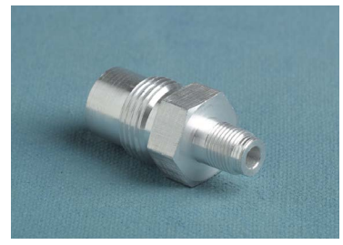
Male D.I.S.S. (metal)

Allow use with standard vacuum regulator Diameter Index Safety System (D.I.S.S.) connections.