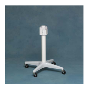
20 in. Roll stand