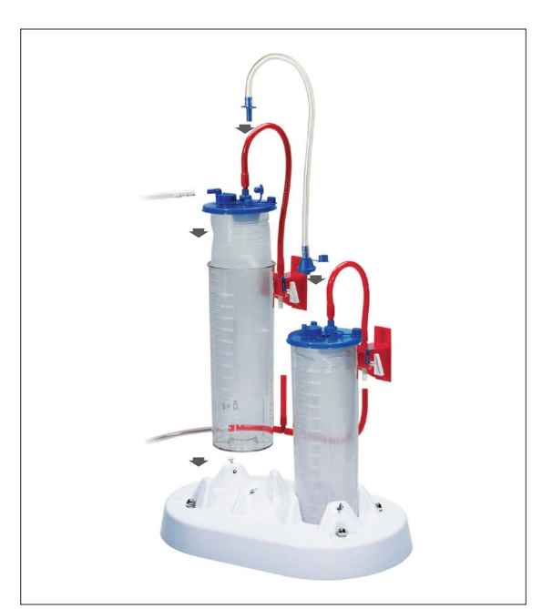
Two-canister floor stand assembly

This is a two-canister floor stand assembly. The stand is mounted on casters for ease of movement.