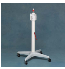
30 in. Roll stand with regulator mount