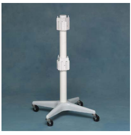
30 in. Eight-canister dual-head roll stand

Not compatible with 3000cc Flex Advantage® Liners.