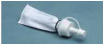
Short specimen sock