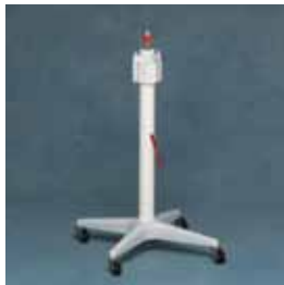
30 in. Roll stand with regulator mount