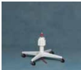
11 in. Roll stand with regulator mount