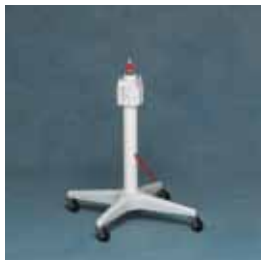
20 in. Roll stand with regulator mount