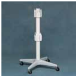
30 in. Eight-canister dual-head roll stand