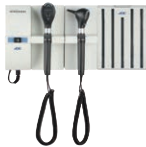
Basic Diagnostix Adstation with 3.5V Standard Otoscope, 3.5V Coax Ophthalmoscope, and Specula Dispenser (5610L-3)