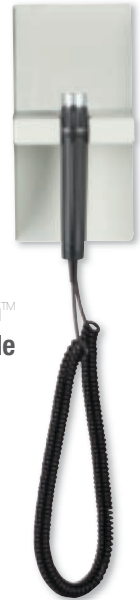
Diagnostix™ Adstation™ Wall Extension Module