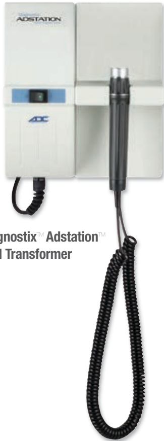
Diagnostix™ Adstation™ Wall Transformer