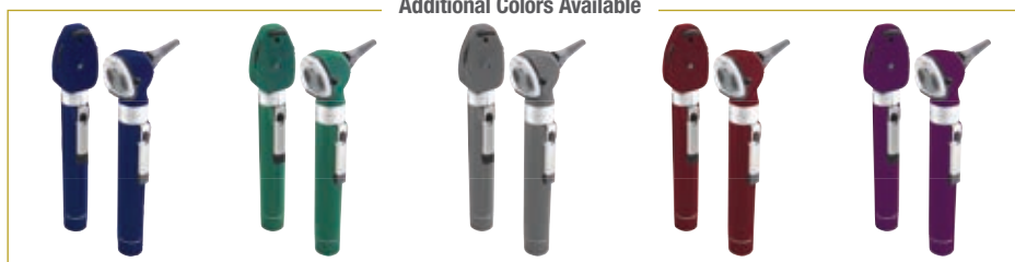
Additional Colors Available

ADC's pocket instruments and sets provide compact portability with feature-rich design. Instruments all use our AA handle with integrated pocket clip (see page 9), with your choice of 2.5V fiber-optic Pocket Otoscope (see page 5) and our 2.5V Pocket Ophthalmoscope (see page 6) instrument heads. Lighting options include xenon illumination, for a brighter, whiter light (3,200K), or our high-performance AdLED lamps (4,200K). Instruments are available individually or in complete, two-instrument sets, in your choice of black or one of five new colors: green, royal blue, purple, burgundy, or gray. Also includes a hard fitted or soft nylon storage case, batteries, disposable specula (with purchase of otoscope), and spare lamps (for all models except 5110E series). Components manufactured in Dubai. Inspected, assembled, and packaged in the U.S.A. Two-year warranty on instruments, lifetime warranty on LED lamp.