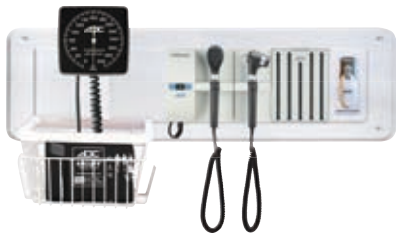
Diagnostix Adstation with Clock Aneroid, 3.5V PMV Otoscope, 3.5V Coax Ophthalmoscope, Specula Dispenser, and Non-Contact Thermometer (5680L-347W)