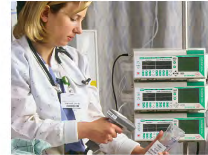
Bedside Confirmation The Outlook Safety Infusion System matches the right medication with the right patient and helps reduce manual programming errors.