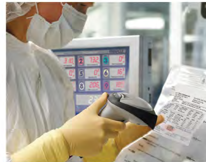
Prescription Verification Scanning the barcode of the patient's prescription is fast and easy. Automation helps reduce manual programming errors.