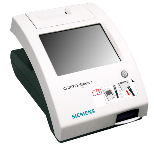
Figure 1-5: Touch Screen Display

Note If you run a CLINITEK Status+ analyzer with a CLINITEK Status connector, you can use a handheld bar-code reader to enter information into the analyzer.