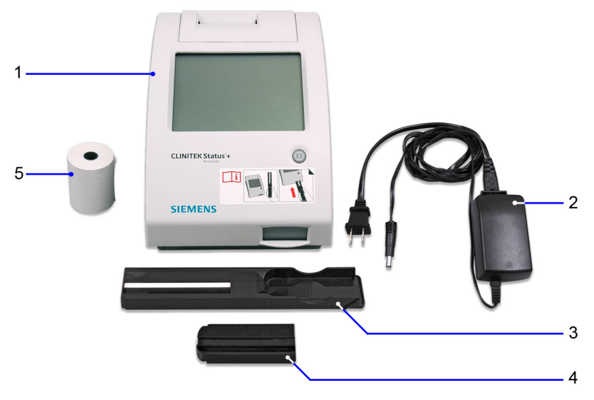
Figure 1-1: Clinitek Status+ Analyzer Components

• Depending on the analyzer model you received, you also could have a Warranty Registration Card, Unpack and Installation Guide, and Quick Reference Card.