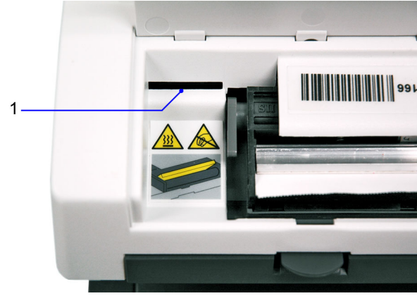
Figure 7-1: Memory Card Slot

3. Insert the memory card (label side up, arrow facing the slot) into the memory card slot to the left of the printer mechanism, until the card stops and then clicks (see Figure 7-1).