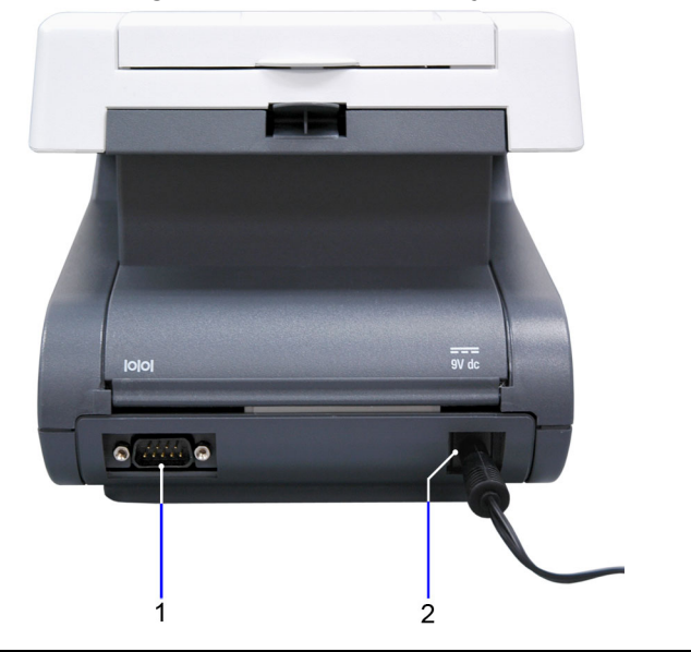
Figure 1-2: Assembling the Clinitek Status+ Analyzer

2. Connect the appropriate end of the power cord into the power inlet socket located on the back of the analyzer (see Figure 1-2 ).