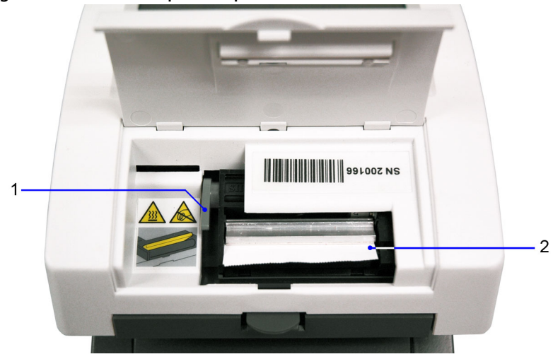
Figure 1-4: Printer Paper Compartment

Note By default, the analyzer automatically prints the test results. To disable the automatic print function, see Section 7, System Configuration, Changing the System Settings , page 107.