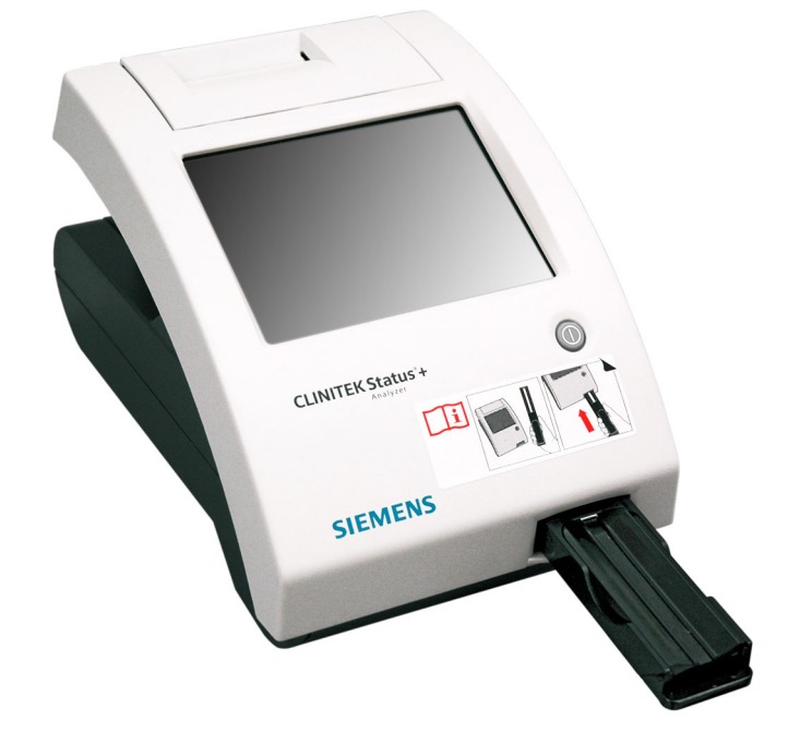
Figure 1-3: The Test Table and Test Table Insert

Note The test table insert adapts for use with a Siemens urinalysis strip or an hCG cassette. Use one side for a strip test and the other side for a cassette test.