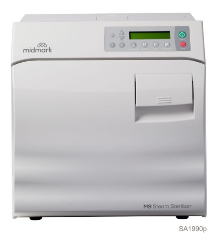
M9 / M9D Models M9 (-040 / -041 / -042 / -043) M9D (-042)