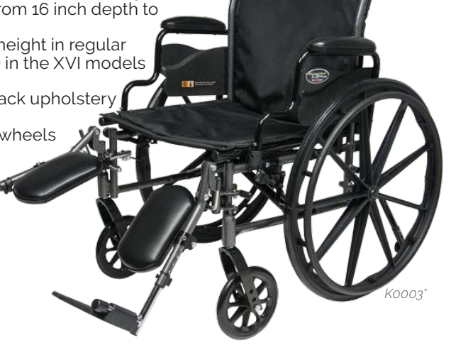
24 inch (60.96 cm) wheel model shown