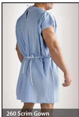
260 Scrim Gown