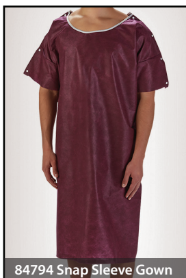
84794 Snap Sleeve Gown