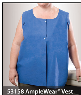
53158 AmpleWear® Vest