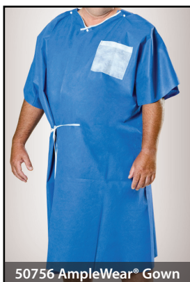
50756 AmpleWear® Gown