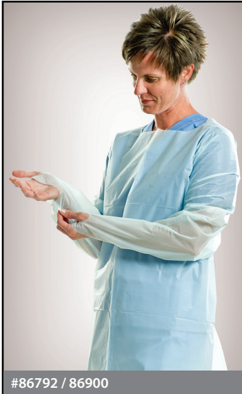
#86792 / 86900

Reduce the risk of cross-contamination and increase peace of mind with disposable Isolation and Protective gowns.